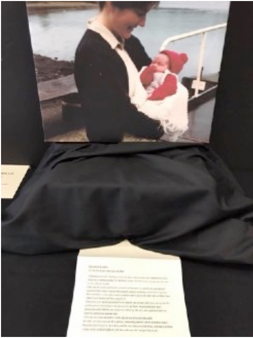
'Red Hat, Red Jumper, Red Socks, Red Mitts- photo and story submitted by a mother